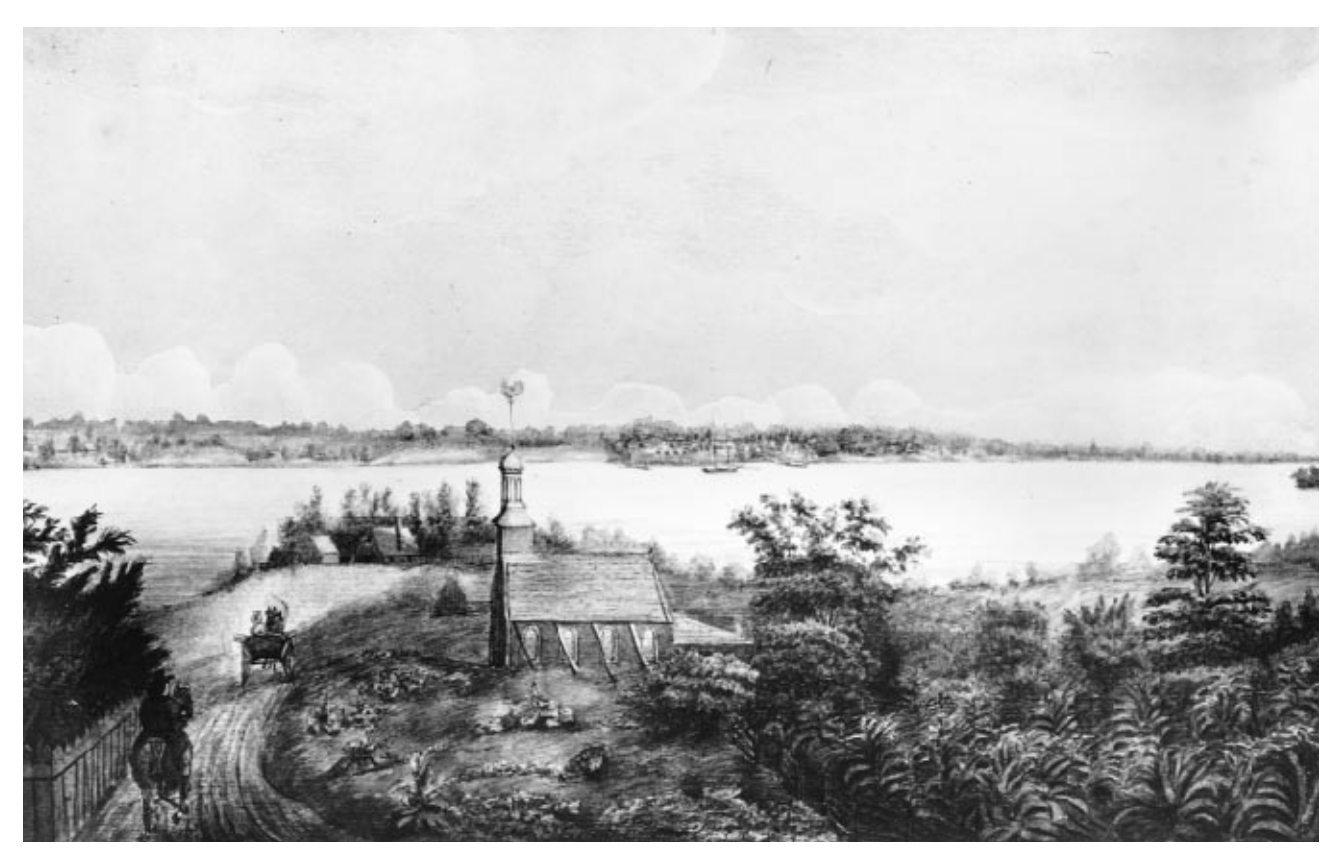
View of Detroit from the Canadian Shore.