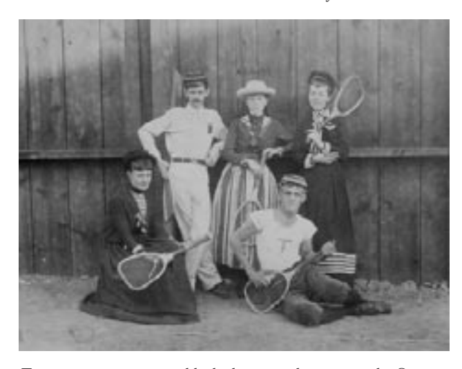
Tennis was a sport enjoyed by both men and women at the Country Club, ca. 1900.