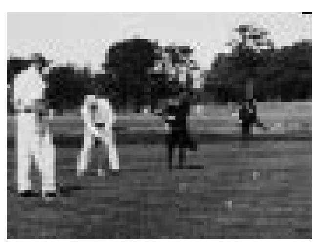
Lining up a putt at the Country Club golf course.