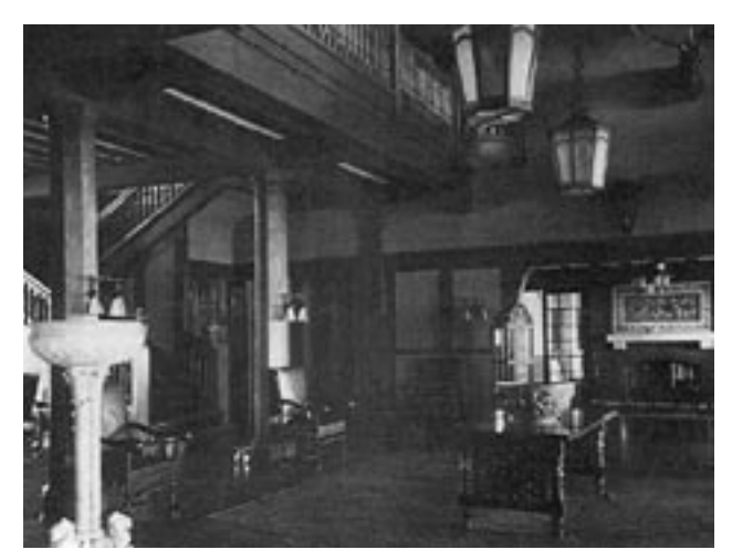
View of the lobby with the stairway to the second floor. Country Club of Detroit, 1907. Note the Pewabic tile over the fireplace at right.