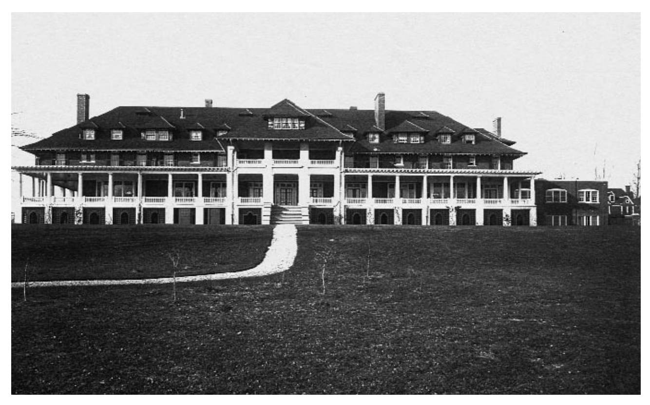
Country Club of Detroit, front view. Club house designed by Albert Kahn, 1907.