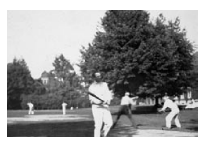
Baseball at the turn-of-the century was one of the most popular activities at the Country Club.

About eight miles from the City of Detroit, Mich. in the beautiful suburban settlement of Grosse Pointe Farms, has been established one of the handsomest country clubs in the "Middle West." The clubhouse is on a point jutting out into Lake St. Clair, and its spacious verandas are kept cool by the refreshing lake breezes. At this peaceful spot the choicest spirits in Detroit society adjourn for relaxation, and the club is