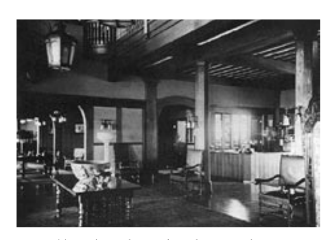
Lobby with Reading and Card Rooms adjoining. Country Club of Detroit, 1907.

There was to have been a yacht race between four 21-footers,