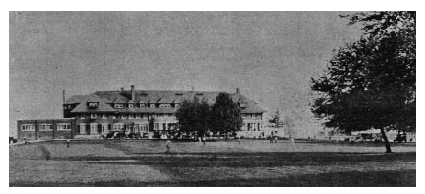
Baseball game on the grounds of the Country Club of Detroit, August 27, 1910.