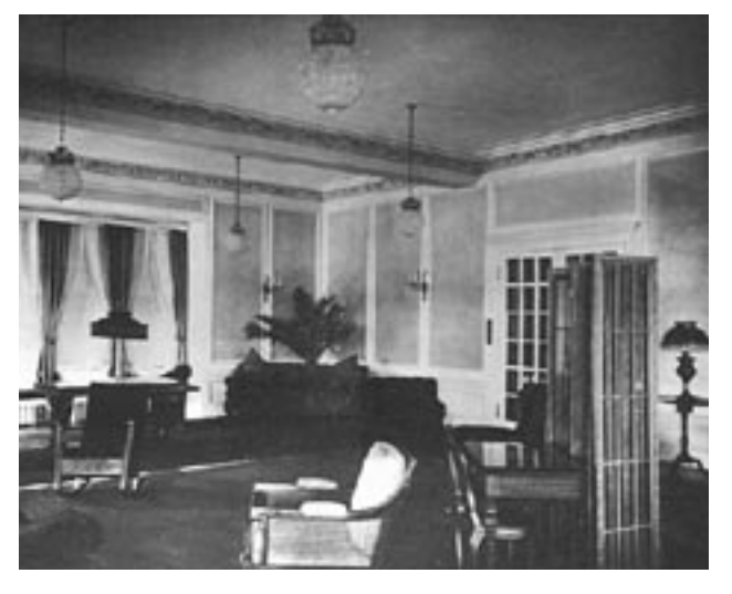
A corner of the parlor. Country Club of Detroit, 1907.