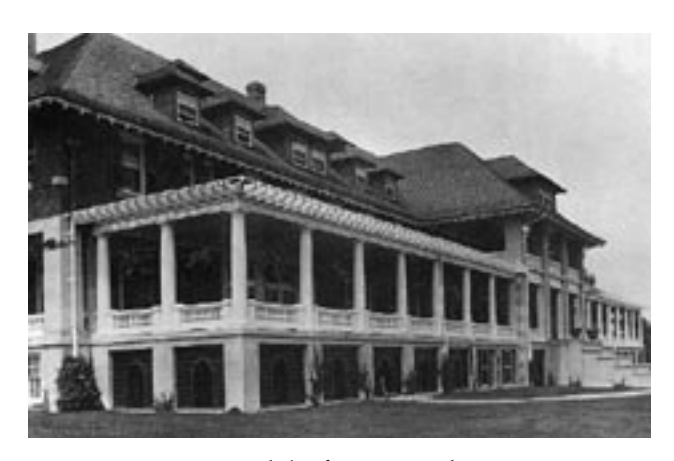
Country Club of Detroit, side view. Club house designed by Albert Kahn, 1907.

reached in thirty minutes from the heart of the city by a special switch that runs the electric cars right into the club grounds.