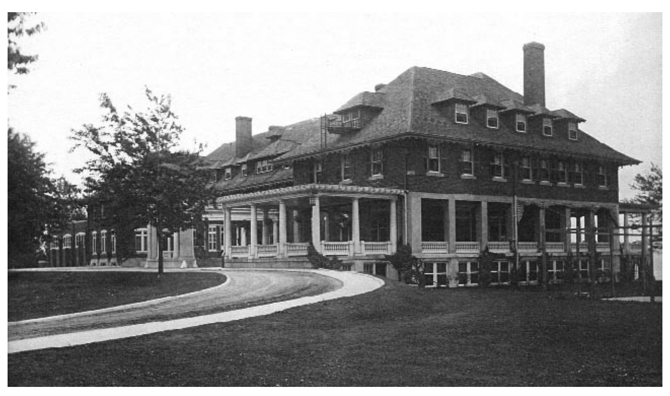
Country Club of Detroit, rear view. Club house designed by Albert Kahn, 1907.