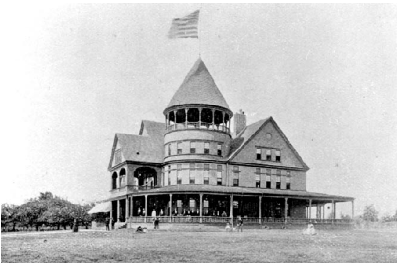
Country Club of Detroit (old Grosse Pointe Club building), ca. 1898.

was played on in the afternoon. This exercise went on for a couple of seasons: golf, with no green fees and no dues, but never on the Sabbath because the McMillans would not have approved.