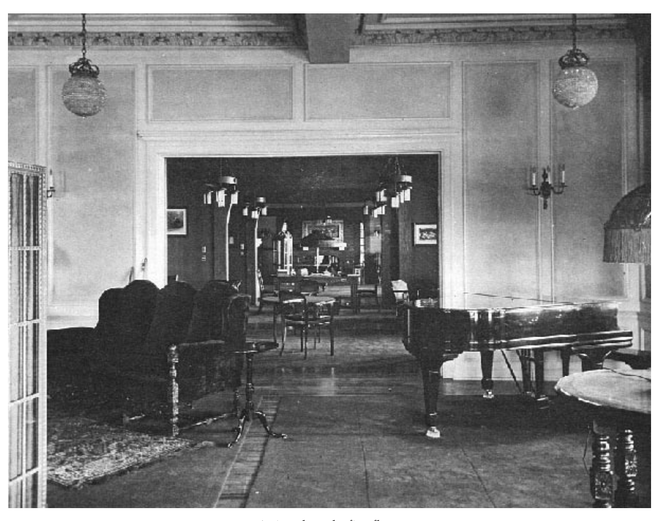
A view along the first floor. Country Club of Detroit, 1907.