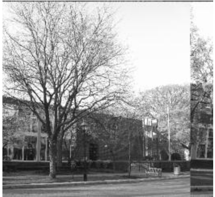
Grosse Pointe Public Library Marcel Breuer, architect 10 Kercheval Ave., Grosse Pointe Farms