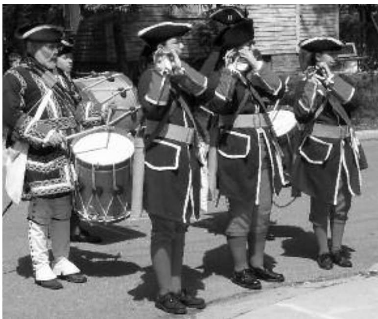
Colonial French Marine fife and drum corps from Port Huron entertains the crowd with traditional music from Detroit’s past at the mini-encampment in May.

Contact the Society at (313) 884-7010 for more information.