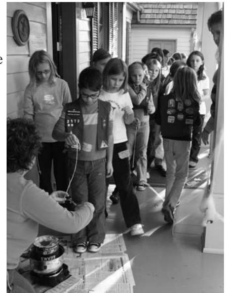
Brownie Troop 2173 of Kerby School visited the Grosse Pointe Historical Society in October as part of their work on a try-it badge "Listening to the Past."

Reserve your space today by calling 884-7010.