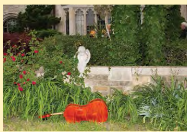
Moonlight at the Manor, 2016