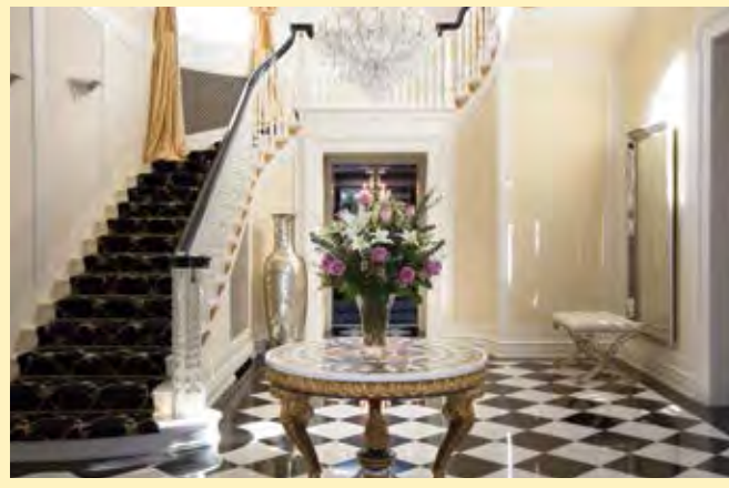
Some Enchanted Evening, 2015