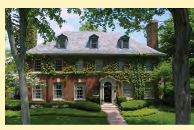
English Elegance, 2014