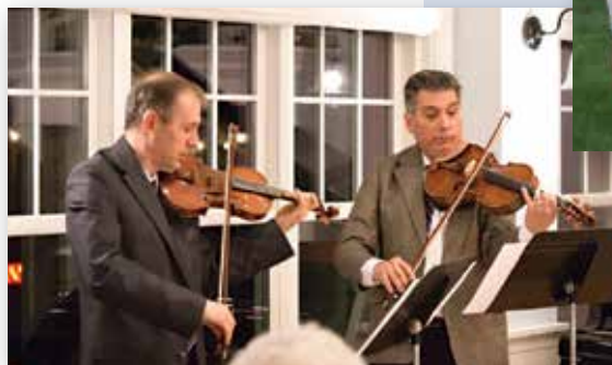
The violin duet with a Stradivarius capped off the evening.