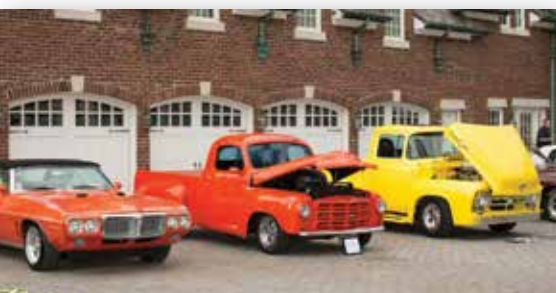
Mike Skinner once again provided vintage cars and trucks on display by the garage.