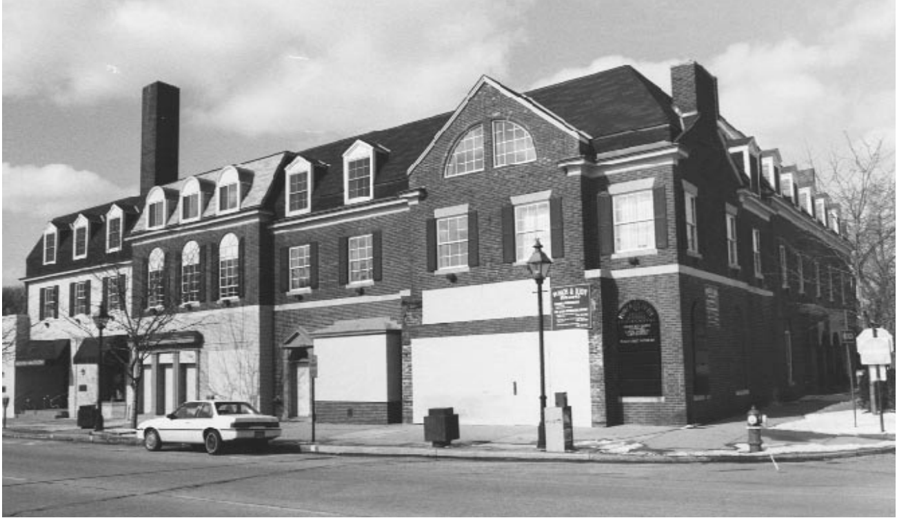
Punch and Judy Building under renovation, 1987.