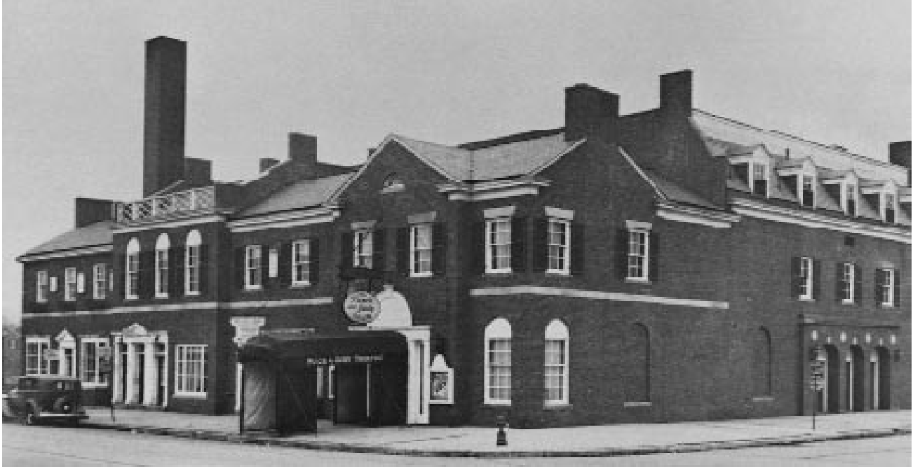
The Punch and Judy as it looked in its glory days of the 1930s.

installed in the Punch and Judy, “was employed in the greater number of installations.” 3