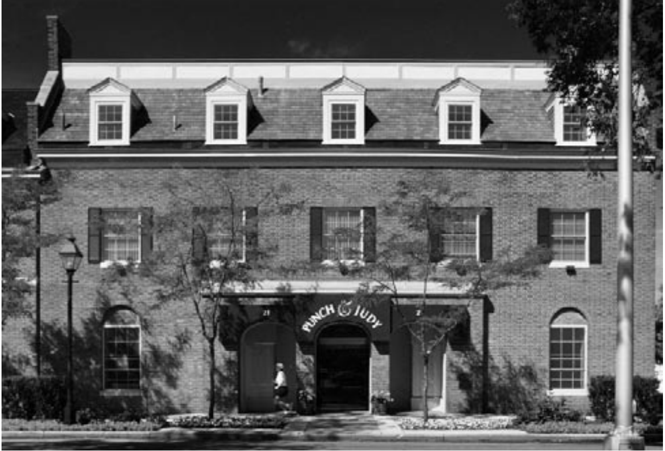
Entrance to the Punch and Judy Building, 1996.

go through with the idea. After that, the theater had six different operators, among them Lou Bitonti and Larry Lyman from October 27, 1977 until April 1979, and Tom Shaker sometime between then and September 1981. That same month the Classic Film Theater took over operations at the Punch and Judy, opening with the film Casablanca . They ran the theater until September 16, 1984.