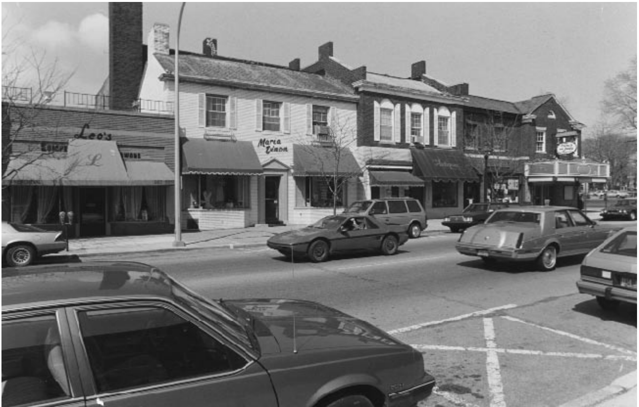
Looking east on Kercheval, the Punch and Judy in the early 1980s.